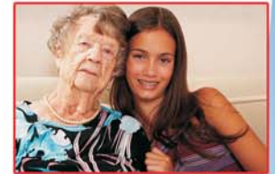
Lower heating costs can help enable elderly people to remain in their own homes

Our Weatherization Assistance Program employs technicians to install energy efficiency and conservation measures in the homes of low-income residents. These measures can include installing insulation, reducing air-infiltration, performing heating and cooling tune-ups and modifications and, when appropriate, replacing heating systems for energy efficiency and safety. This will reduce the fuel consumption and fuel bill burden for these low-income households for many years to come.